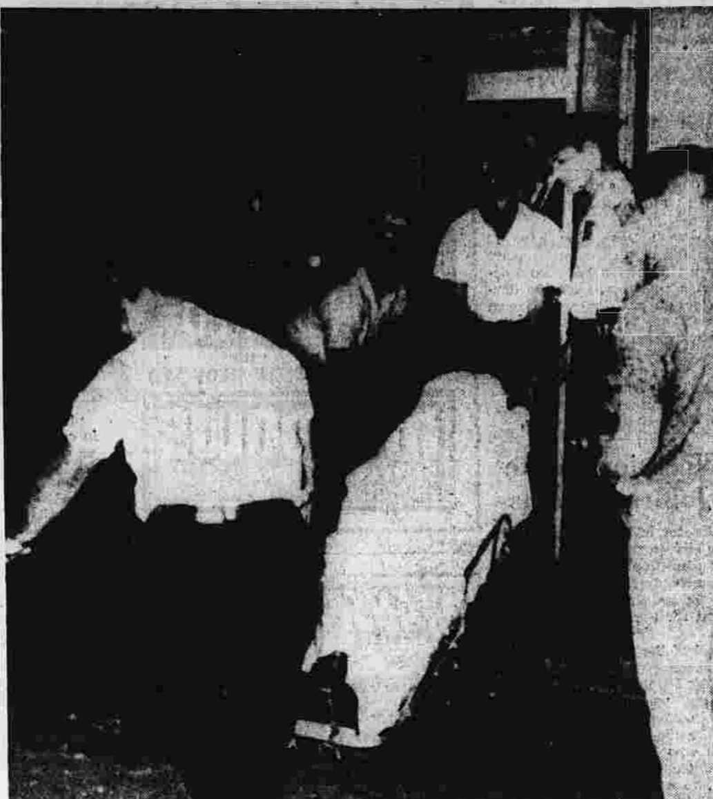
One of five persons found shot in a New Haven apartment is carried into an ambulance. The body was not identified for newsmen at the scene.